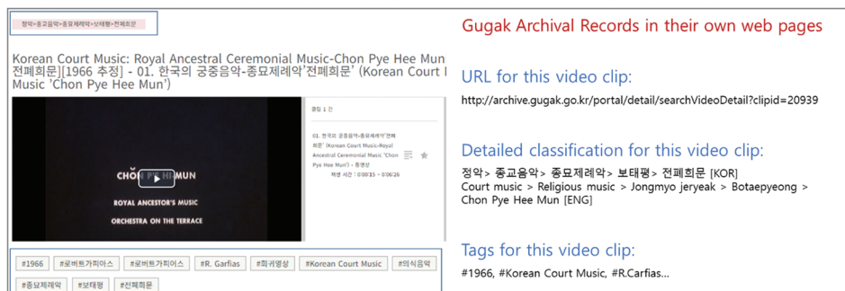
Figure 3. Individual archival records in Gugak Archive website < http://archive.gugak.go.kr/portal/detail/searchVideoDetail?clipid=20939 >.

In addition, the classification and keyword information provided on the website of Gugak Archives are not equally reflected in K-PAAN. There is a difference in the unit of classification of records among the institutions that make up K-PAAN service, which may not be distinguished on the portal performing arts archive website. To improve this, the records manager and the website architecture should cooperate concretely the building criteria for the structure of records provided to K-PAAN. In most cases, the records managers of individual institutions have less authority over data structure or services of the web site in the case of portal sites than their own websites. It is also convenient for users to use the portal site as a starting point for searching. Therefore, the quality control of the portal site should also be considered.