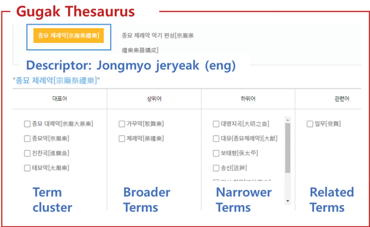
Figure 1. Gugak Thesaurus term “Jongmyo jeryeak” < https://archive.gugak.go.kr/portal/division/thesaurusMain >.

However, in the Gugak Archive website, the classification scheme and the thesaurus does not used sufficiently for navigation or reciprocal linking of Gugak performance records. The below is the screen of the Gugak thesaurus for the term, “Jongmyo rite music”. The term cluster is formed around the descriptor.